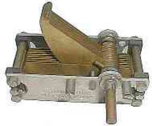
Picture 2. Rotary air capacitor

Picture 2 shows a good quality, ceramic insulated, sturdy, air dielectric rotary capacitor. It is used for C1, and its value is 500 pF (pico Farad) when closed. D1 is a germanium point contact (cat's whisker) diode, or a crystal detector. With a set of piezoelectric headphones, this radio provides near hi-fi (High Fidelity) sound as much as the AM bandwidth permits such quality reception. As these types of crystal headphones provide only capacitive loading, the 200 Kohm R1 resistor is required, and the 1 nF (nano Farad) capacitor is unused. When using magnetic headphones, resistor R1 is not necessary and the 1 nF capacitor C2 is required.